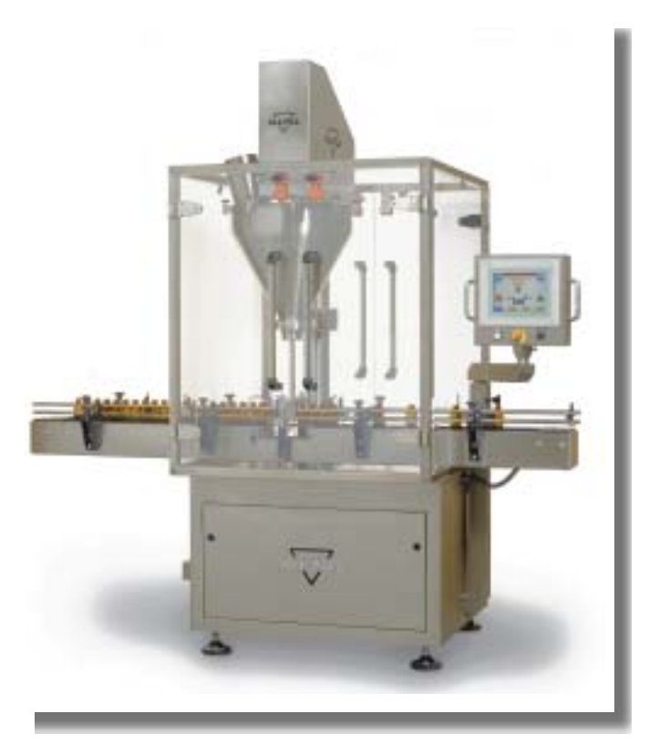
Dry suspension antibiotics, 20g to 60g, into narrow-neck glass bottles at up to 30 per minute, with neck location for precise neck-entry lift.