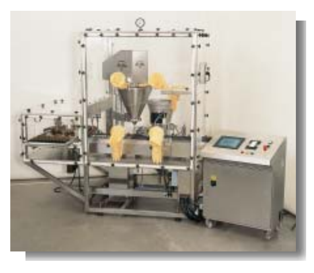
Integrated unscrambling filling and stoppering system in fully sealed glovebox enclosure for precise gravimetric filling of biological analysis samples into vials and small bottles.

Filling heads are supplied direct to end-users and machine builders for integration into vertical form-fill-and-seal, sachet and cartonning equipment. They also form the basis of our automatic in-line and high-speed rotary systems.