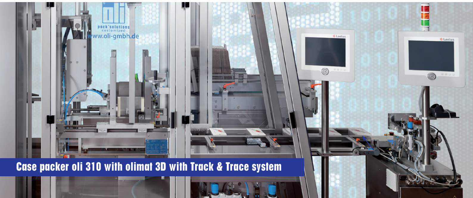
Case packer oli 310 with olimat 3D with Track & Trace system

oli Track & Trace guarantees complete production safety and transparency for the pharmaceutical industry.